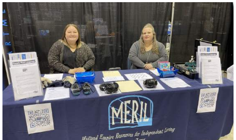
We met students and shared information about disability service careers at the My Success Event!